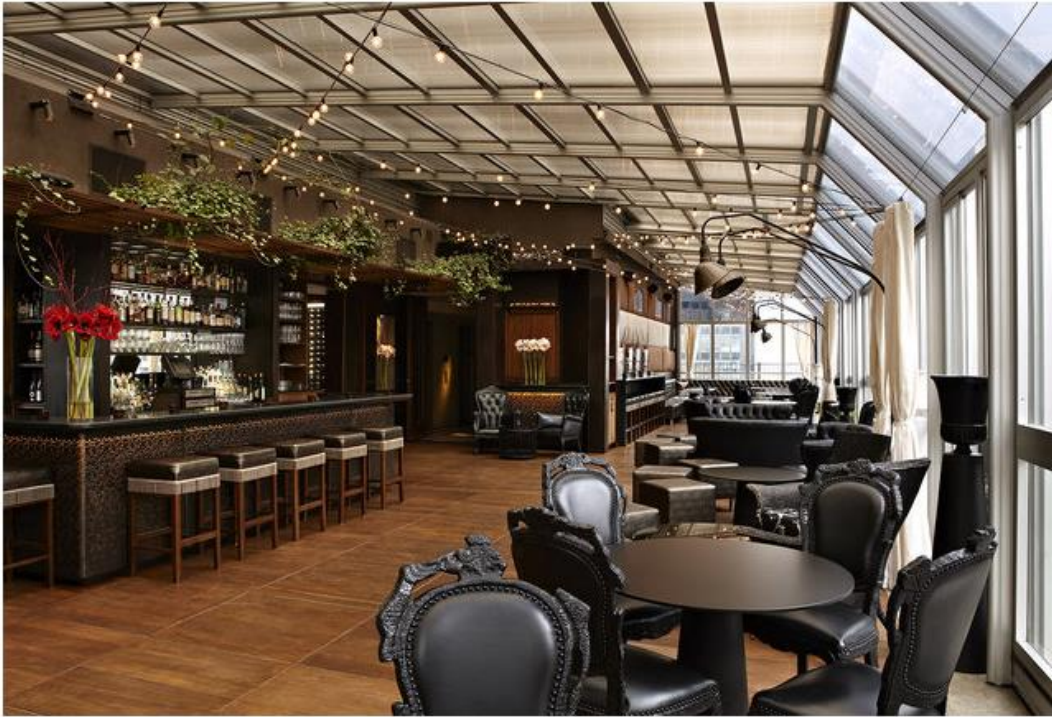
UPSTAIRS AT THE KIMBERLY

A great reason to go to the West 30s, and our favorite bar near the Times Square subway stop , Skylark has wraparound views, a beautiful, classic bar inside, and heat lamps outside.