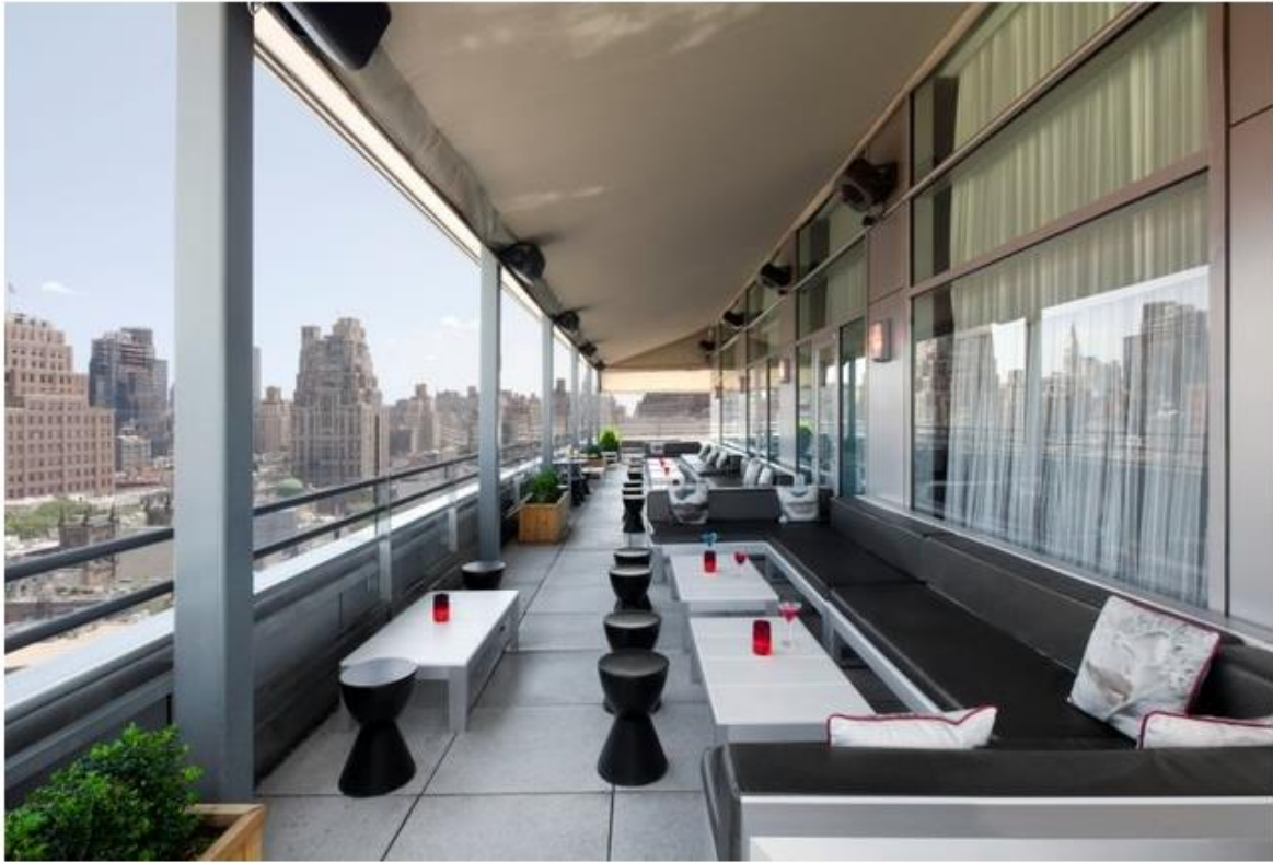
THE GANSEVOORT HOTEL