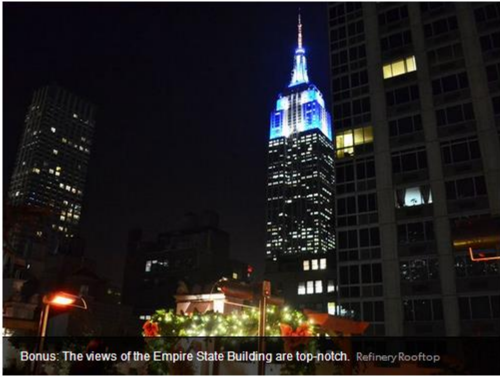
Bonus: The views of the Empire State Building are top-notch. Refinery Rooftop